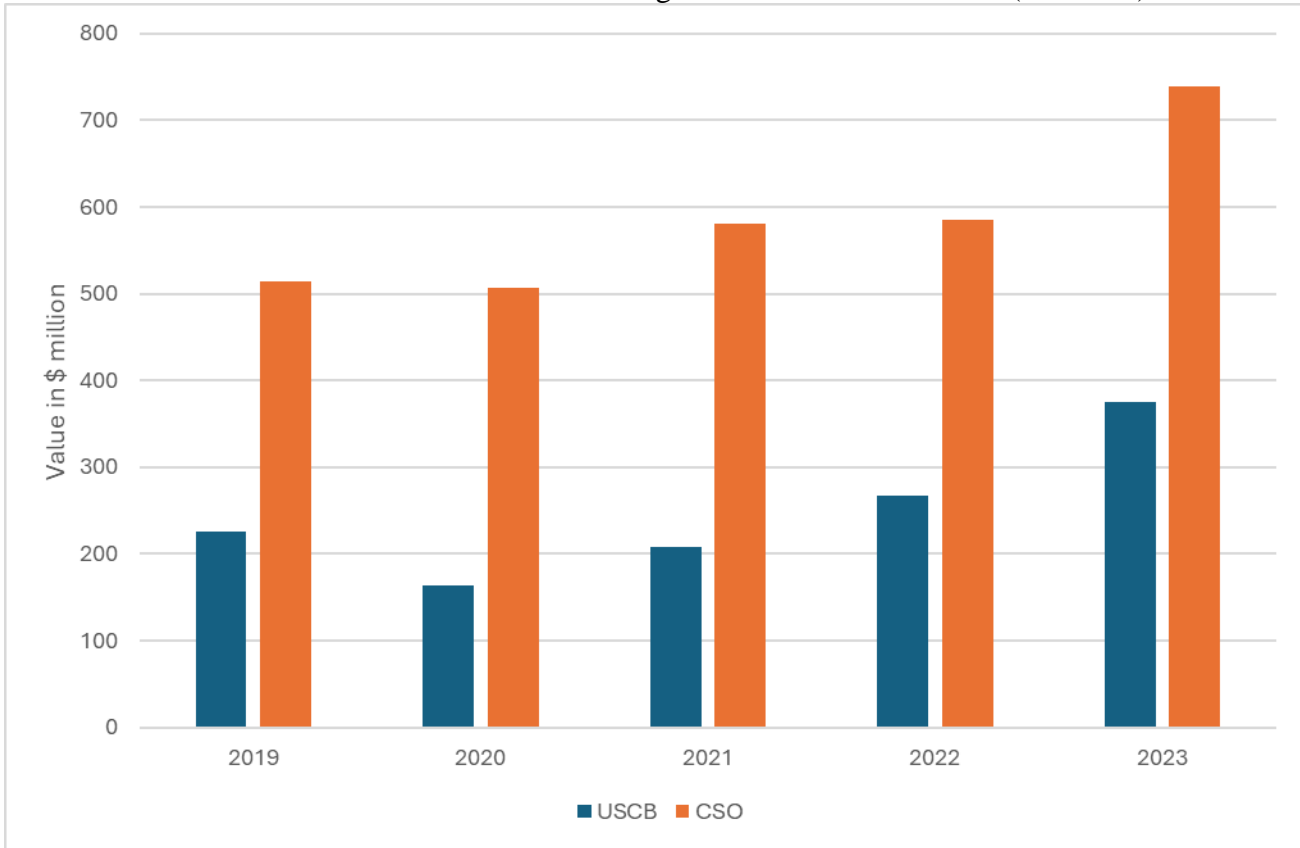
Chart 1: USCB and CSO Data on U.S. Food and Agricultural Trade to Poland ($ million)